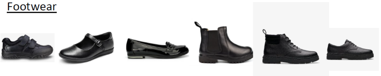
Black shoes or boots to be worn on non-PE days (examples above). Trainers must not be worn on non-PE days.