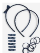
Discrete, navy hair accessories