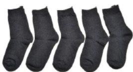
Plain grey socks or tights