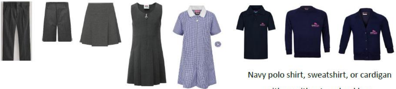
Plain grey trousers, shorts, skirt or dress Navy, gingham dress