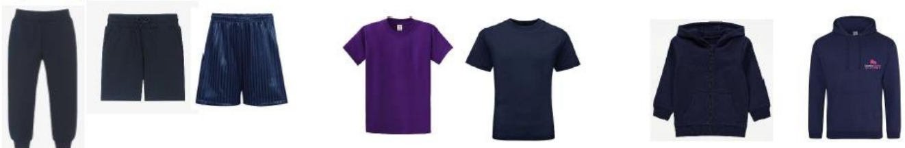
Plain navy joggers or shorts No cycle shorts or leggings